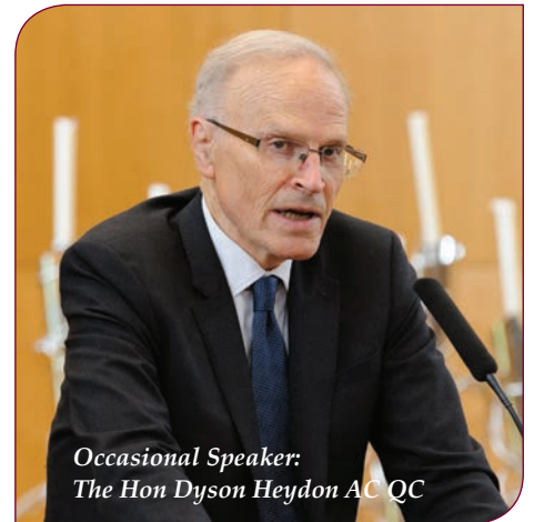
Occasional Speaker: The Hon Dyson Heydon AC QC

We might complacently think that a reversion to Elizabethan standards of poverty could not happen. We might complacently think that the evil of religious