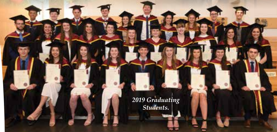
2019 Graduating Students.

Vol. 19 | No. 1 Lent Term, Summer | 2020