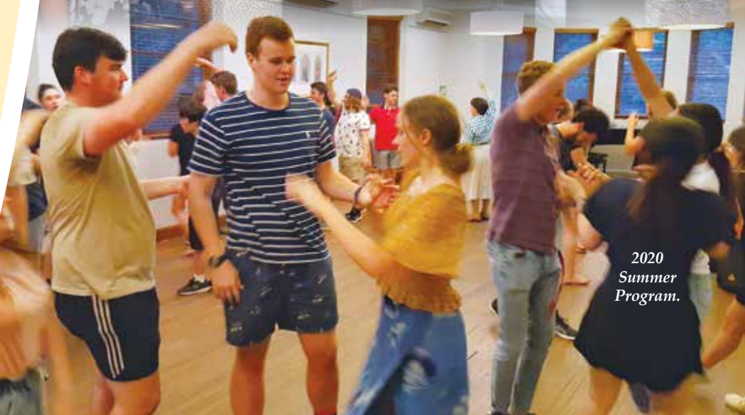
2020 Summer Program.