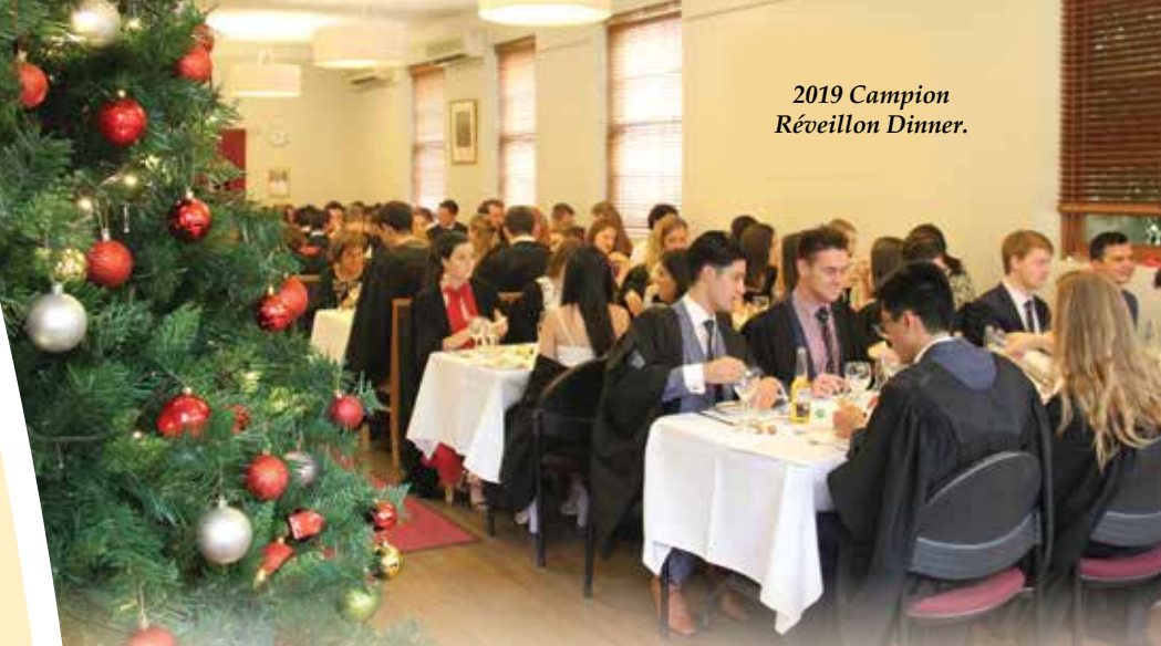
2019 Campion Réveillon Dinner.