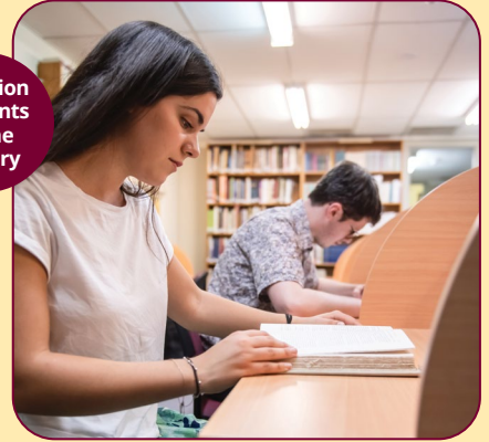
Campion Students in the Library

The guarantee of monthly funds will continue to assist with all projects and works that support our Mission, to provide a foundational education