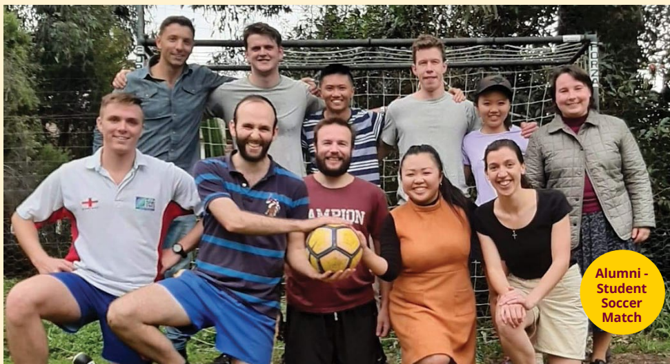
Alumni - Student Soccer Match