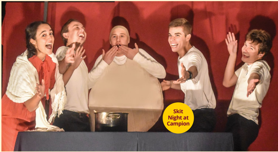
Skit Night at Campion