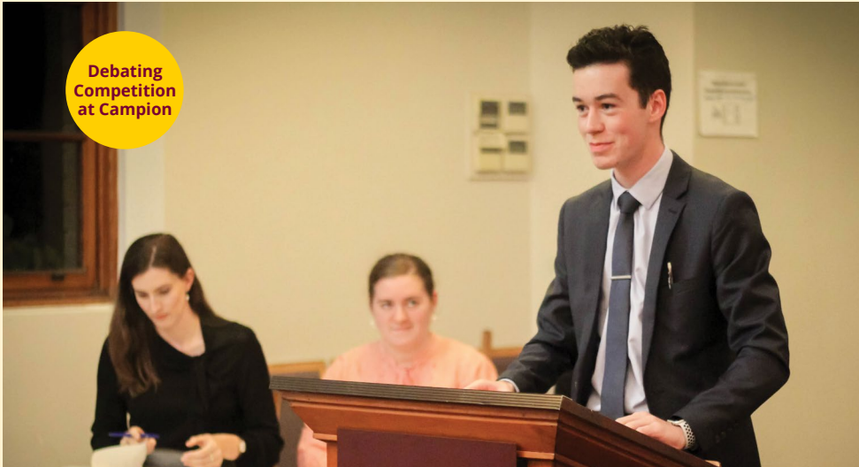
Debating Competition at Campion