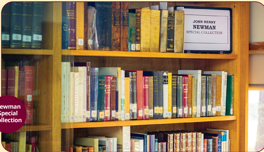
Newman Special Collection