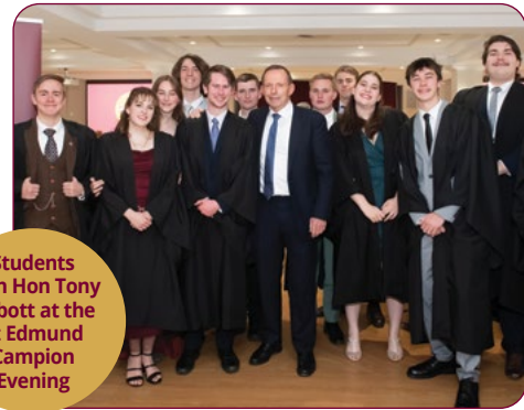
Students with Hon Tony Abbott at the St Edmund Campion Evening