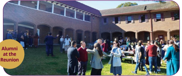
Alumni at the Reunion

Campion College proudly hosted its first major alumni reunion Friday 12th to Sunday 14th of July welcoming over 100 former students, along with their spouses and children, back to the campus. The event was a resounding success, filled with nostalgia, learning, and renewed connections.