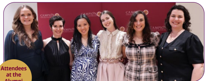
Attendees at the Alumni reunion