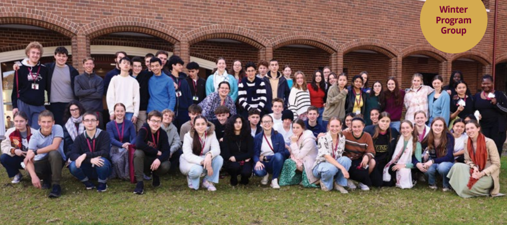
Winter Program Group