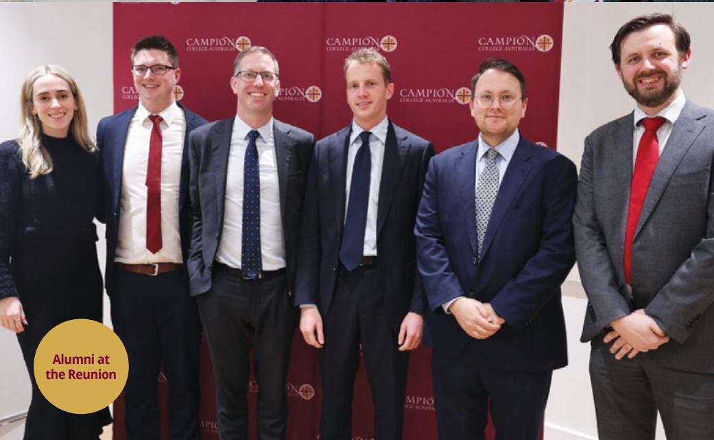
Alumni at the Reunion